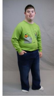
Clothes by Downs Designs ®