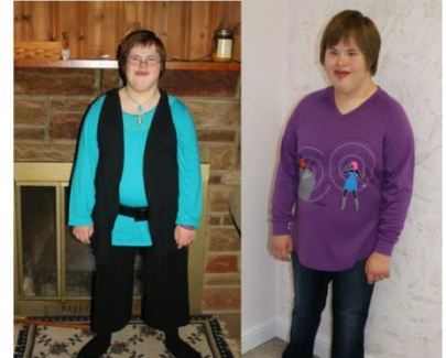
Off the rack clothing