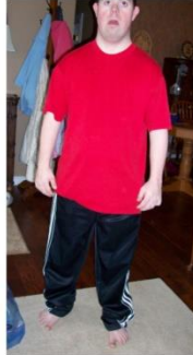
Off the rack clothing

Listed below are a few facts about individuals with Down syndrome that can create clothing challenges. This list reflects the difficulty with pants only, not upper body garments.