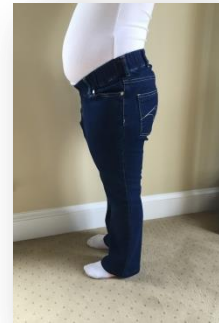
Downs Designs ® "Dip Down" Jeans

Solution: Our Adopt-A-Jean ® Program allows us to donate jeans.